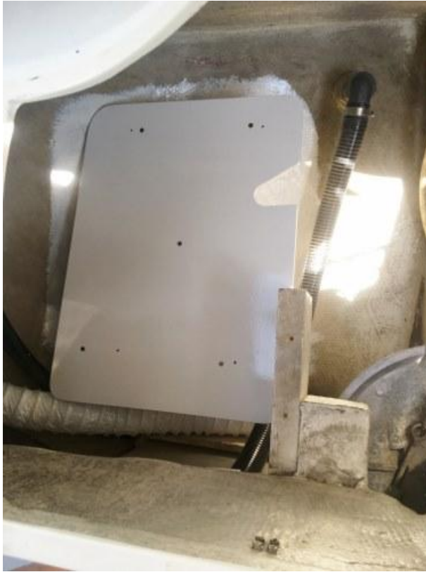
Photo (17) shows the new shelf the locker will sit on installed onto the support structure. The shelf is ½" plywood primed and painted with Interlux Brightside primer and topcoat white paint. It is attached with #10-32 flat head SST machine screws with SST flat washers and SST nyloc nuts on the underside.