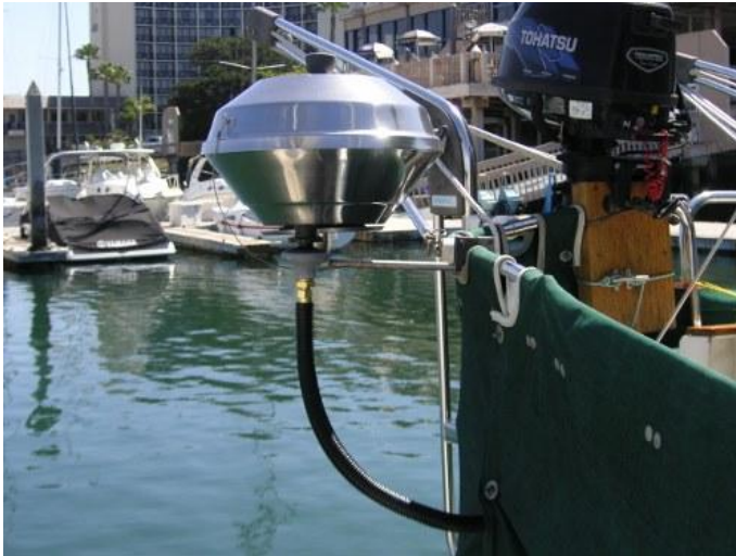
Photo (29) shows the propane hose attaching to the low pressure regulator on the rail mounted Magma grill.