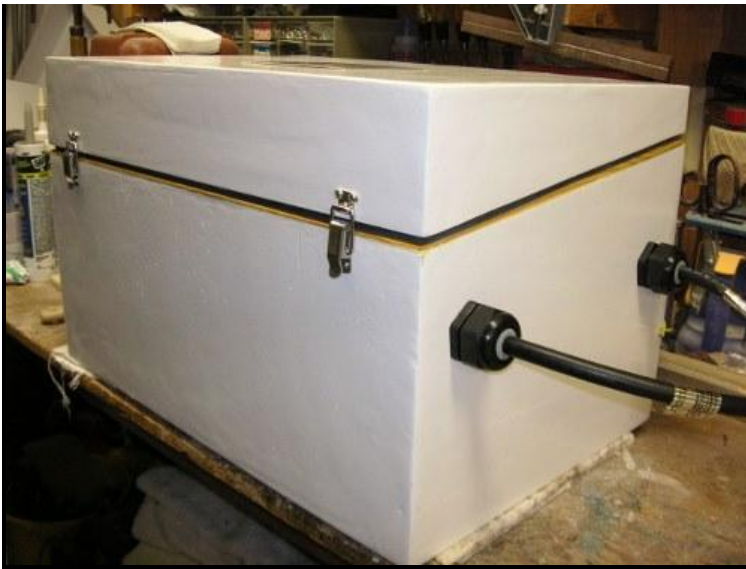
Photo (23) is a side view of the completed locker bottom with the top installed and clamped tight. This provides a view of the vapor tight fittings sealed around the propane hoses. The propane hose supplying the galley is on the right, and the propane hose supplying the grill is on the left.