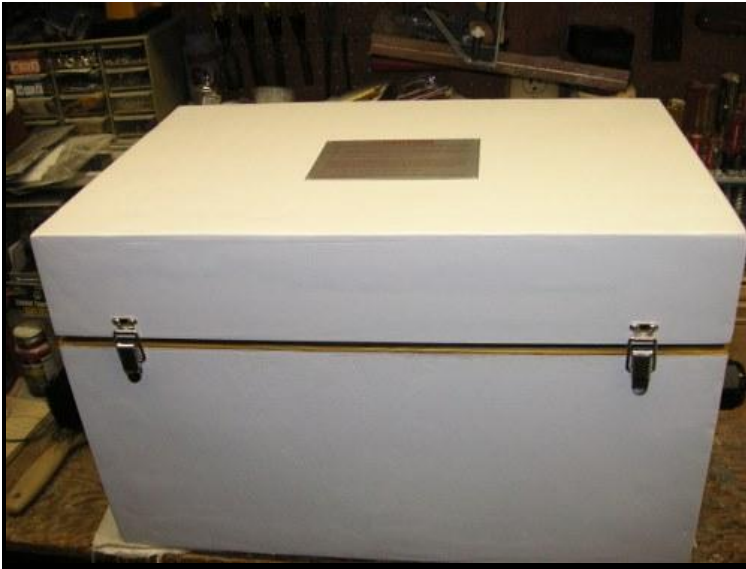
Photo (22) is a front view of the completed locker bottom with the top installed and clamped tight. There are four SST latches, two on the front and two on the back. They are the same type and brand as used on the original propane locker. Also notice the caution plaque on the top.