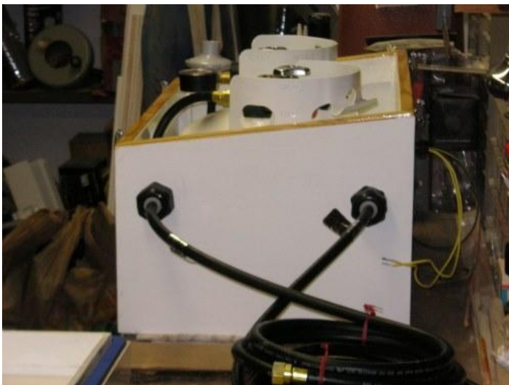
Photo (20) is an end view of the completed locker bottom with the tanks and components installed showing the vapor tight seals, propane hoses, and electrical wires from the solenoid.