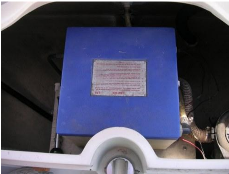
Photo (1) is the original propane locker mounted on the wood cover above the steering radial. It provides great access to the tank, gauge, and regulator. Being in the center of the lazarette opening blocks access for additional storage space. Photo (2) shows the externally threaded bulkhead fitting on the starboard side of the propane locker that the hose to the galley stove connects to.

The following photos show the boat before the propane system upgrade to help give you a perspective of my starting point. The text description for each group of photos is above them.