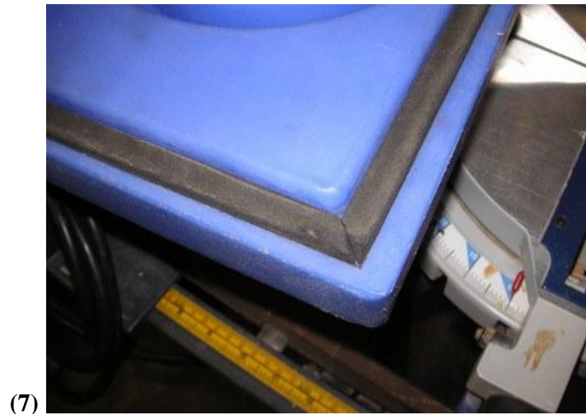
Photo (7) shows the gasket on the underside of the propane locker top. Photo (8) shows the inside of the original propane locker. The propane tank is original to 1987 so no OPD valve and no way to refill it. Lots of threaded connections and there was always a propane smell inside the locker.