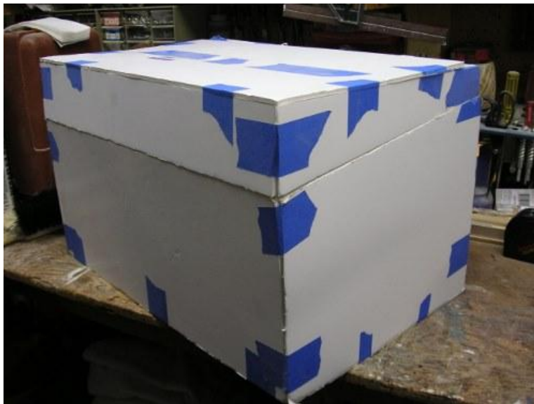
Photo (12) shows the final mock up with the mating surface between the top and the bottom changed to an angled surface. This change made it easier to remove both the top of the propane locker, and the propane tanks when it's finally installed in the aft lazarette.