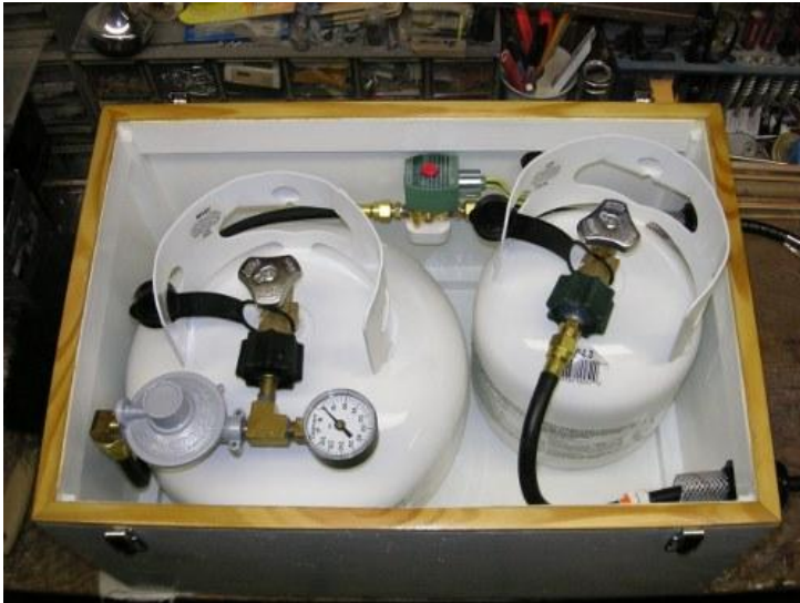
Photo (19) is a similar view showing the completed locker bottom with both tanks, on/off solenoid, regulator, gauge, hoses, and vapor tight seals installed. It's hard to see, but there is a drip loop in the wires from the solenoid to the vapor tight seal.