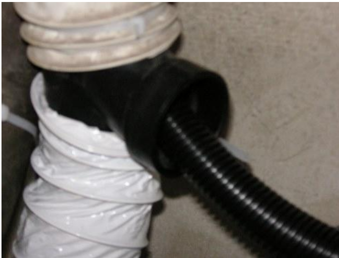
Photo (27) shows the hose supplying propane to the low pressure regulator on the externally mounted Magma grill protected by the .75" split loom entering the vent hose through a 3" x 3"x 2" sanitation tee. The tee is tie wrapped into the 3" vent hose that runs from the deck mounted cowl vent, through the aft lazarette, to the engine compartment.