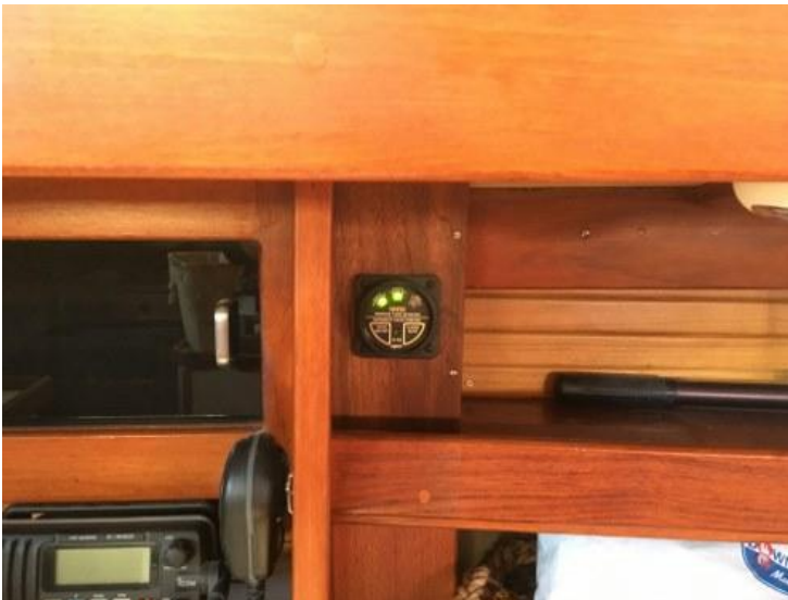
Photo (33) is a closer view of the S-1A display powered up in standby mode with the propane locker solenoid turned on.