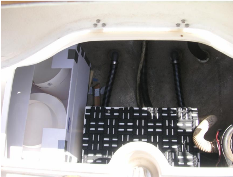
Photo (11) shows the mock up installed when looking down into the center of the aft lazarette from the cockpit. You can see the radial cover, the tiller cap, and part of the manual bilge pump for reference.