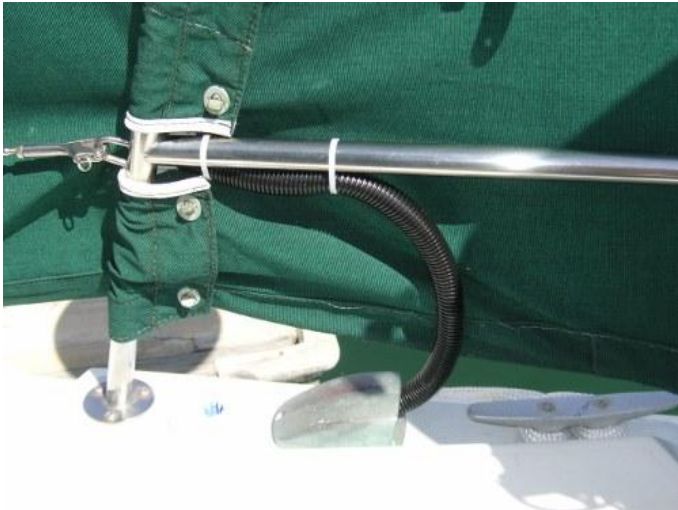
Photo (28) shows the hose supplying propane to the low pressure regulator on the externally mounted Magma grill inside the .75" split loom exiting the vent cowl on the aft deck. The hose is then tie wrapped to the horizontal stern rail for support.