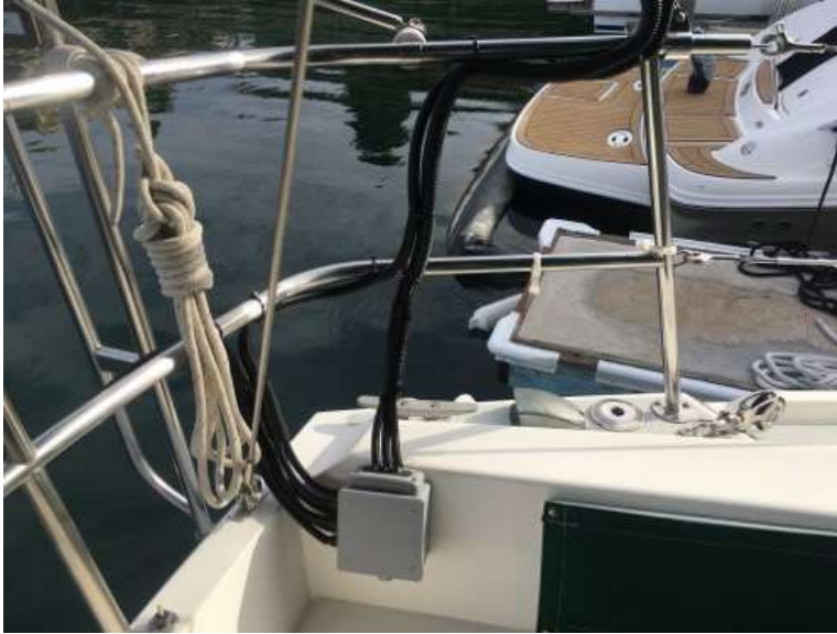
Photo (7) shows the finished Cockpit Transition Box. I used split loom to cover the wires and antennae coax cables to provide UV protection. The wires and antennae split looms are then tie wrapped to the push pit to keep them secure and out of the way to avoid them getting damaged.