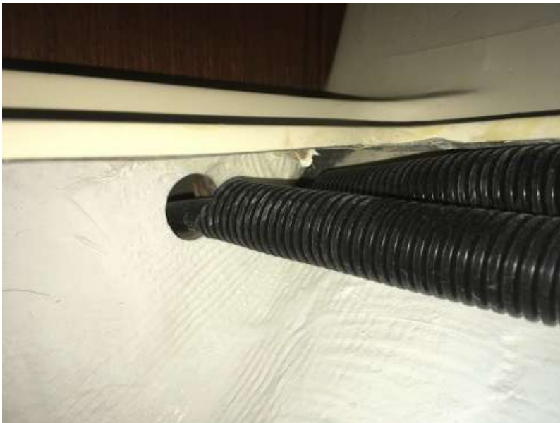
Photo (14) shows a close up of the bulkhead between the aft cabin and the galley. The propane hose exits the left split loom and passes thru a hole in the bulkhead to the back of the stove. The solar panel wires exit the right split loom and pass thru the gap between the hull and bulkhead. The wires continue between the liner behind the stove and the hull exiting past the refrigerator.