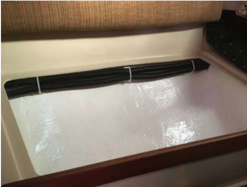
Photo (13) shows how the two split looms, one containing wires and one containing the propane hose, run and are secured along the inside top surface of the seat locker in the aft cabin.