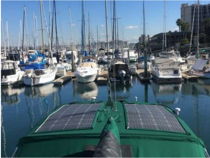
Photo (4) shows an overview of the port and starboard solar panels installed.