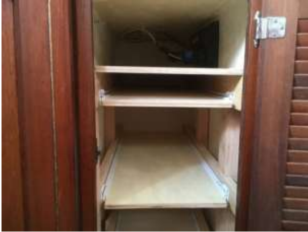
Photo (12) shows the 1/4" plywood top shelf and how the sides are notched so it can slip over the top of the 2" x 3" vertical rail supports. This ensures the top shelf will be removable if needed when the 2 x 3 vertical rail supports are epoxied to the walls of the locker.