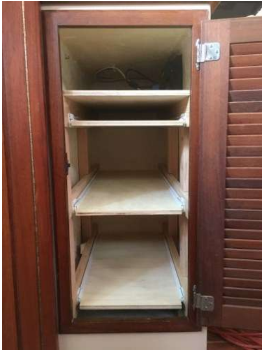
Photo (9) shows the drawer bottoms installed onto the Blum standard drawer slides to check for fit and smooth opening.