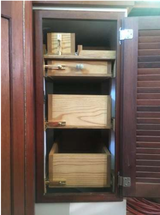
Photo (20) shows all of the finished drawers installed with a slide bolt for each. The upper drawer is so close to the top shelf, that it can't be opened by pulling on the drawer front like the others, so I installed a knob to open it.