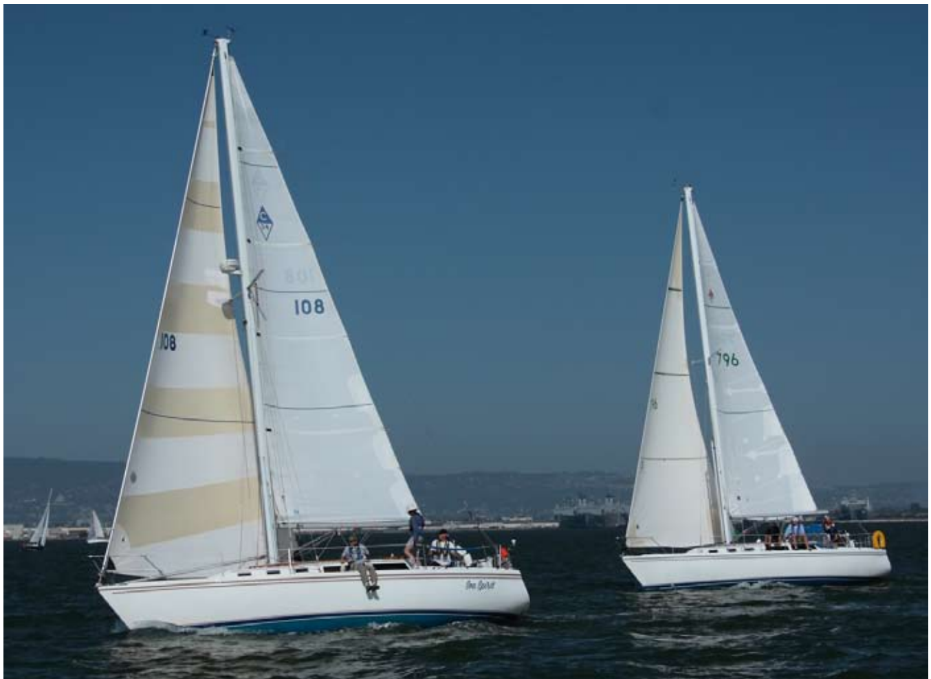
Sea Spirit leads Amandla to the finishing line in Race 5

Compete details can be seen at: http://www.sfbayraces.com/IC000.php