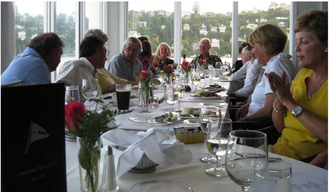
Fleet 1 members enjoy dinner in CYC's historic Dining Room

We also enjoyed the CYC's Friday Night Racing, some great jazz and a wonderfully prepared steak and seafood dinner at their beautiful historic dining room. The folks at the CYC were very accommodating and we look forward to another fun and successful return next year! Thanks to all our members for making this a truly memorable cruise in!